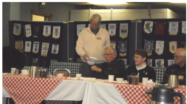
The Lighter Moment..Rtn Bob's Corner

http://www.youtube.com/watch?v=MjPmmCtHmfE