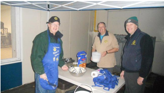
End of Movember Month