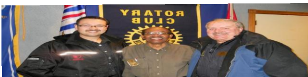
Thanks to three PROSTRATE Rtns who kept a stiff upper lip in aid of the PROSTATE Cancer Fund Raiser during that month. Just shows why Rotary has to be in everything to achieve best results!