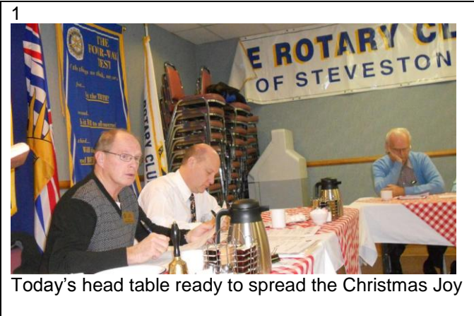
Today's head table ready to spread the Christmas Joy

This is Christmas and Family Month in Rotary (So spread the Joy)