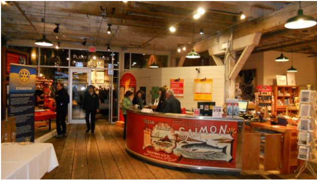
Come on in!