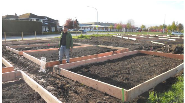
Community Garden takes root – One stalwart was still there hammering away early on Tuesday morning. He had no idea that everyone had left on Sunday!