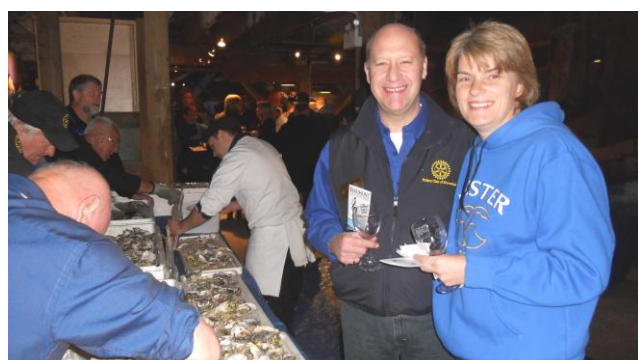
Never met these two but they look like they would make a good working team!