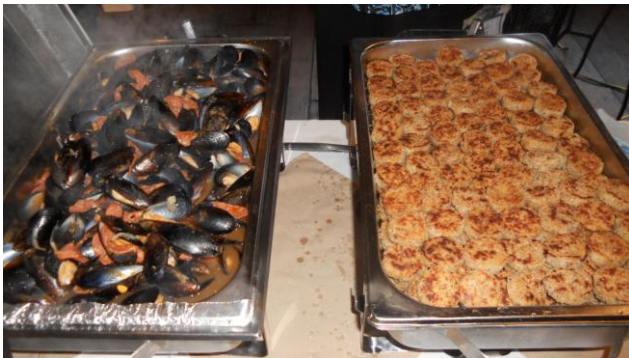
And the culinary dishes!