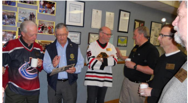
Well I am sure you know what the results were! The Forty-Niners got clobbered!