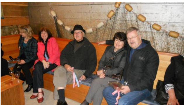
Looks like the group from Langley Goldkey