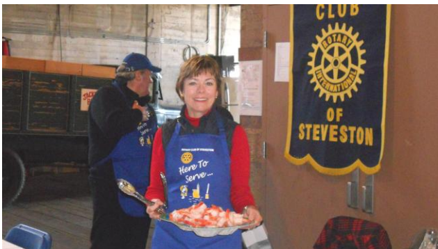
Certainly knows How To Serve!